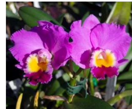
Exhibition type Cattleya (Brunswick hybrid)