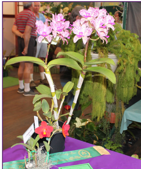
More MDOS Show entries