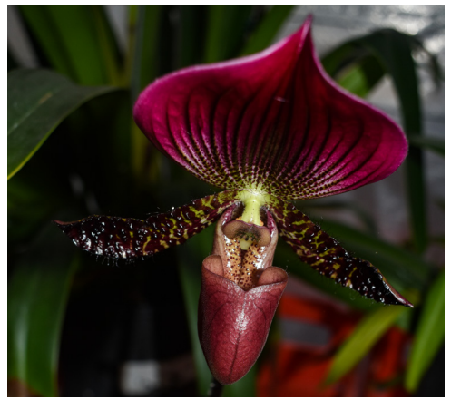
Paphiopedilum Hsinying Ruby Red