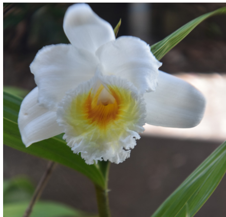
Sobralia Mirabilis 'Santa Barbera' flowering on Australia Day.

Our next meeting will held on the 30th January starting at 2pm at Sharon Stretton's residence, 16 Watt Street, Gympie. If you head up River Road from the roundabout behind Centro, Watt Street is the first turn to the right, and just after the big stand of pine trees.