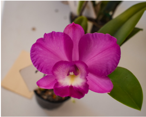
C. Dal's Buddy "Bette"

To sum up, it was a fine day in the country, but quite windy with the benched orchids' racemes swaying a bit wildly in the breeze at times; taking steady photos was a challenge.