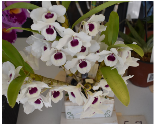
Den. Snowflake X Merlin X Carny X Yukidaruma