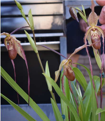
Phragmipedium Grande 'Chinaman'