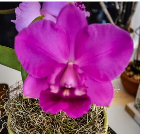
C. Aloha Case 'Ching hua'