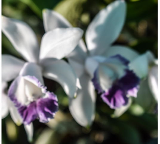
C.intermedia coerulea X intermedia coerulea

It was encouraging to see so many plants tabled by our members at this meeting and the variety and quality of the plants.