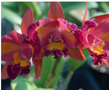
C. Aussie Sunset 'Cosmic Fire'