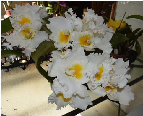
Blc. Ranger Six X Sylvia Fry X Hawaiian Jewel