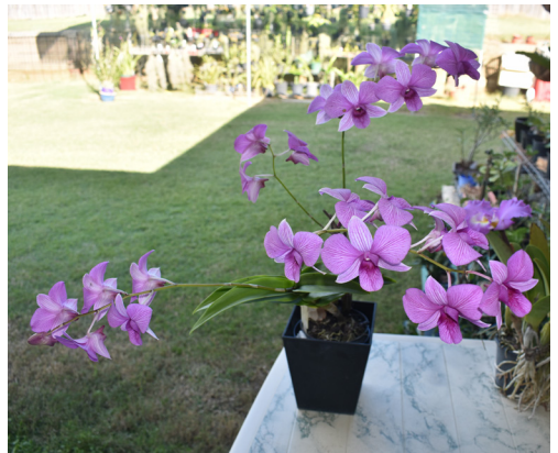
Den. Kiliani Stripe 'Northern Star'