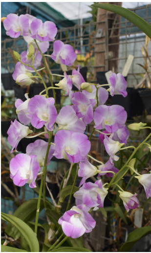
Den. Burana Stripe