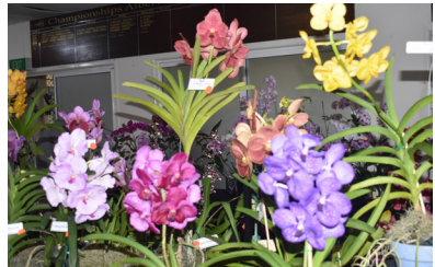
The tall vandas looked beautiful grouped together.