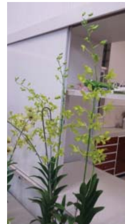
Den. Fraser's Canary 'Twist' C. Deception Spots 'Southern Cross' X Netfrasife