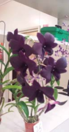
Den. Black Pearl