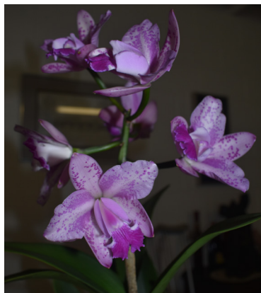
C. Monte Elegance Richard X C. caudebec 'Carmela'