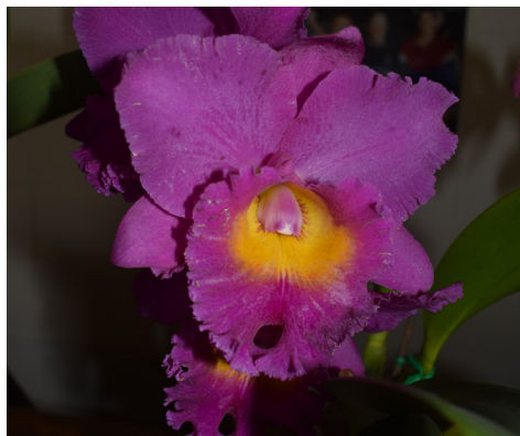
C. Erin kobyshu X Calico Queen