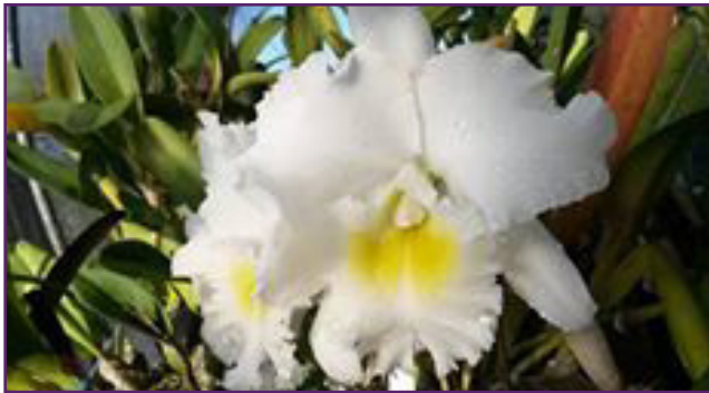
BC Mount Hood 'White'

Our orchids seem to have a mind of their own when it comes to flowering and will adapt to the conditions they are sheltered in and climate variations of the year. Laelias in our district which are normally out for our May show flowered later this year so there were fewer entries and some growers found their dendrobiums were also a bit behind.