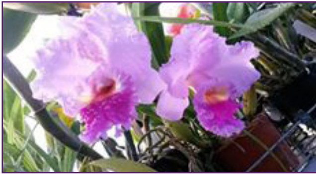
Blc Owen Holmes x Blc Sunstate Colour Chart) x Blc Burdekin Heights Pinky