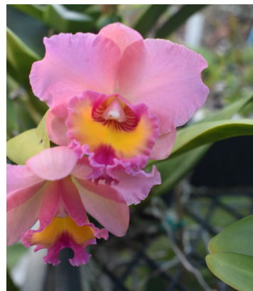
Cattleya Royal Beau 'Anthea'