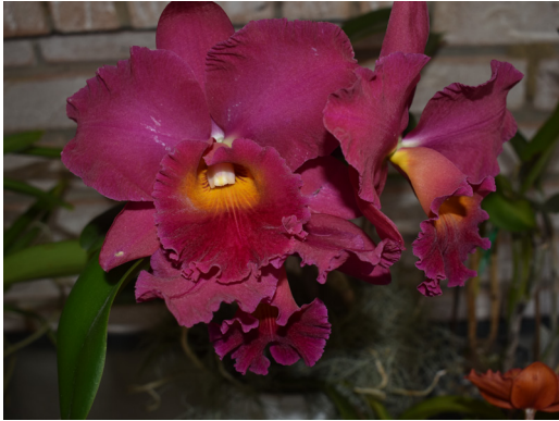
C. Goldenzelle 'High Noon' X Golden Canefields