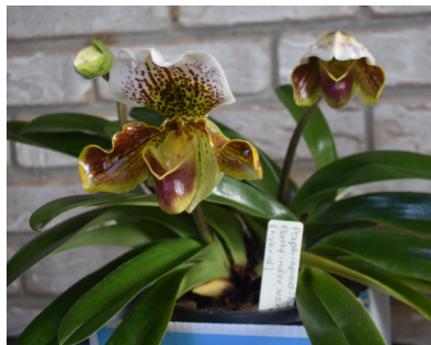
Every paph deserves its moment in the sun.

Jim cautions against using too much fertiliser high in nitrogen in winter or when plants are coming into flower.