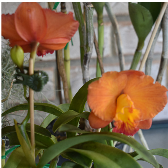
C. Memoria Warren Eggins

Top cut vandas to divide and repot. Some growers use florists tubes filled with liquid fertiliser for vanda roots to be immersed in to encourage rapid growth.