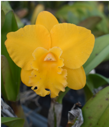
Cattleya Dal's Moon 'Cynthia'