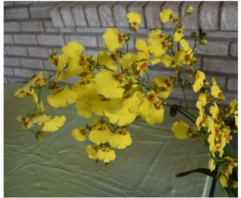
Onc. Sweet Sugar