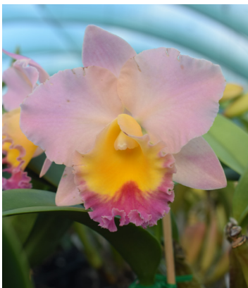
Cattleya Lisa Taylor Gallis 'Lydia'