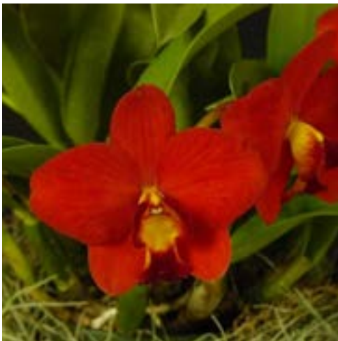
C. Precious Jewel