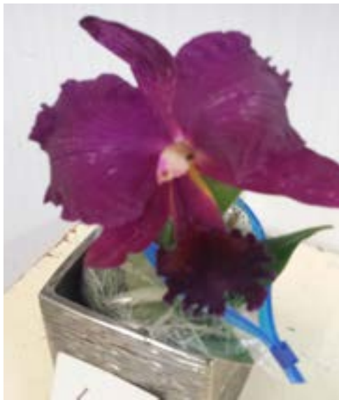
Pot. Burdekin Nugget grown by Noelene Auer

The Australian Orchid Council (AOC) website accordingly has an updated list as of Feb. 2017 of all of its awarded plants with old names and new names side by side, available as a .pdf download. This list includes most commonly grown genera and intergeneric crosses so you can adjust the names accordingly for your plants. Click this orchidsaustralia link. Go to page 4 for more detailed information on the Cattleya Alliance.