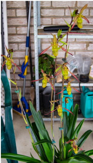
Phrag, Sorcerer's Apprentice