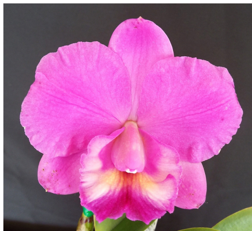
C. PV Case "Lulu"