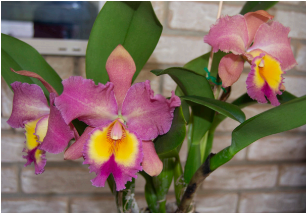
C. Cooloola Sunset