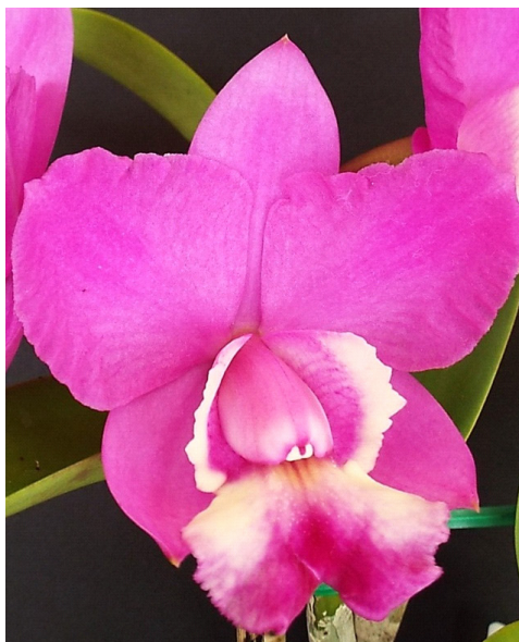
C. PV Case 'Lipstick' HCC

Jim presented 13 plants, 10 flowering, 2 in bud and 1 without flower, C. PV Elusive Case 'Magic' which had previously won a HCC award. On the day of judging C. PV Case 'Lipstick' was also awarded a HCC and C. PV Case "Lulu" was awarded an AM. Of the two plants in bud one looked particularly promising but was not sufficiently opened to be judged on the day.