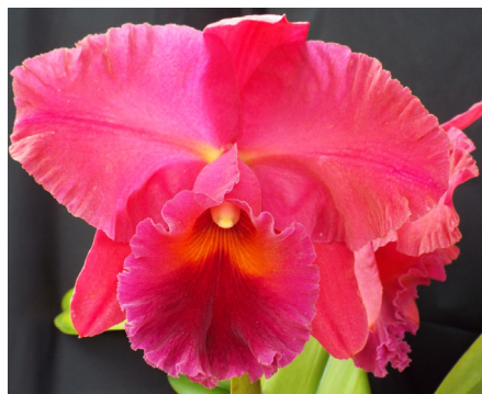
Rlc. Sedona's Golden Kaleidoscope 'Tom' HCC (awarded in February)