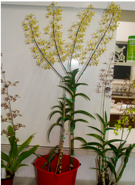
Den. Spiral Gem X Jaqueline Thomas X caniculatum