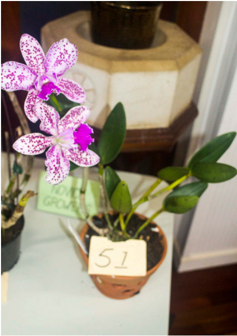
C. Caudabec Candy