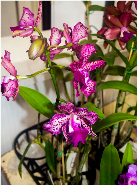
C. Caudebec X Caudebec