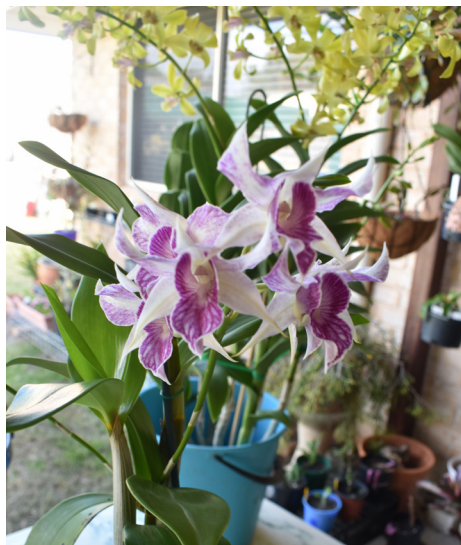
Den. Peter Shen 4N X Silver Wings 4N

Don Elms brought the plant on the left to our meeting. It's flowers display the features of Latouria type dendrobiums. This genera includes about 50 different species with the majority native to Papua New Guinea and some to Samoa. They grow in hot, humid rain forests attached to the trees in tropical areas where it rains year-round.