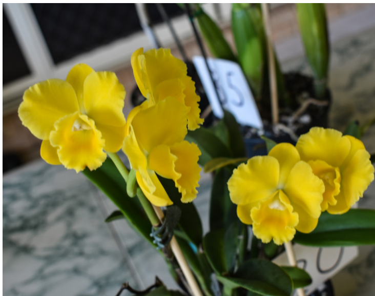
C. Dal's Emperor "Michelle"