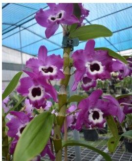
D. Star sapphire HCC/AOS