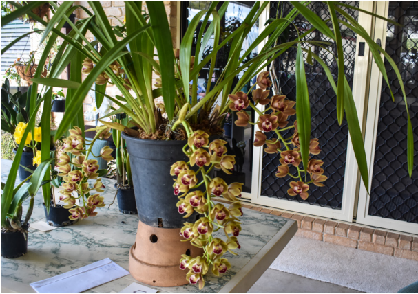
Cym. Sarah Jean X Last Tango "Geyserland"