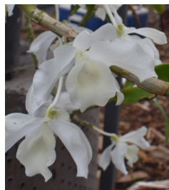
Dendrobium nobile var. virginalis 'Alba'