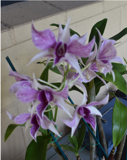
Den. Fire Wings