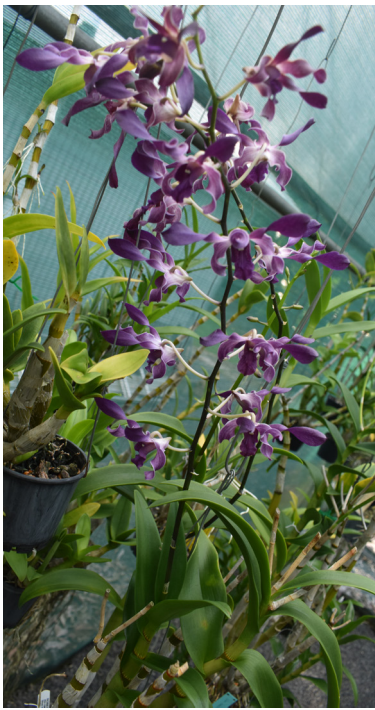
Den, Twisted Blue

The main topic of this meeting was fine tuning plans for our May orchid show. There was discussion about limiting the size of specimen pots because of space restrictions. The matter was subsequently decided upon and an updated show schedule reflecting changes has been sent to all attending orchid clubs.