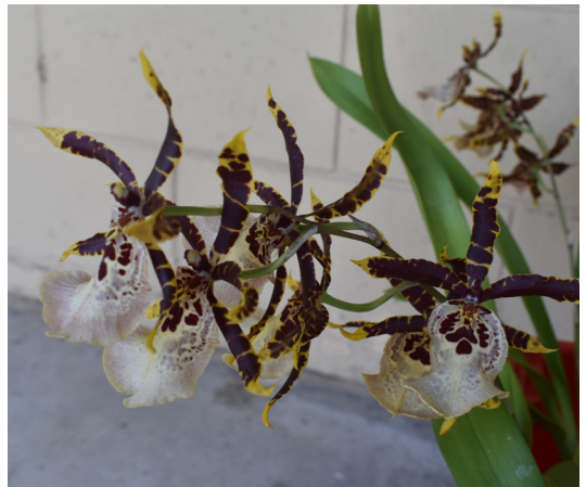
Deg. Flying High 'Stars & Bars'