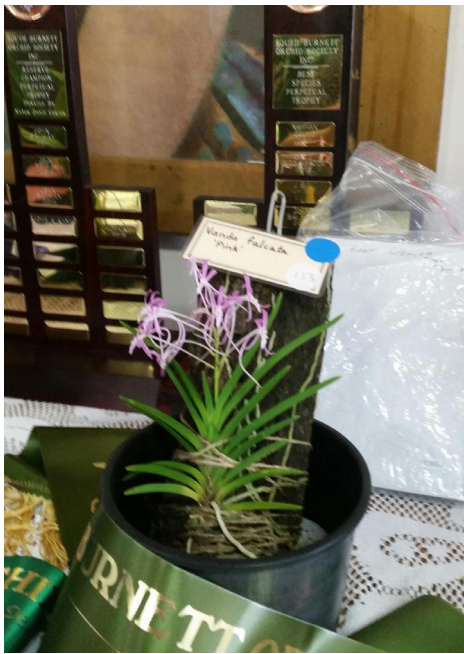
Vanda falcata was the best species at the show