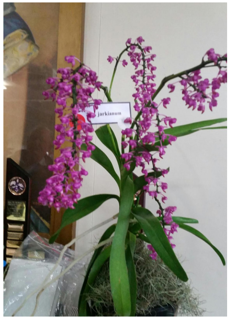
This Aerides won the best Specimen Award.